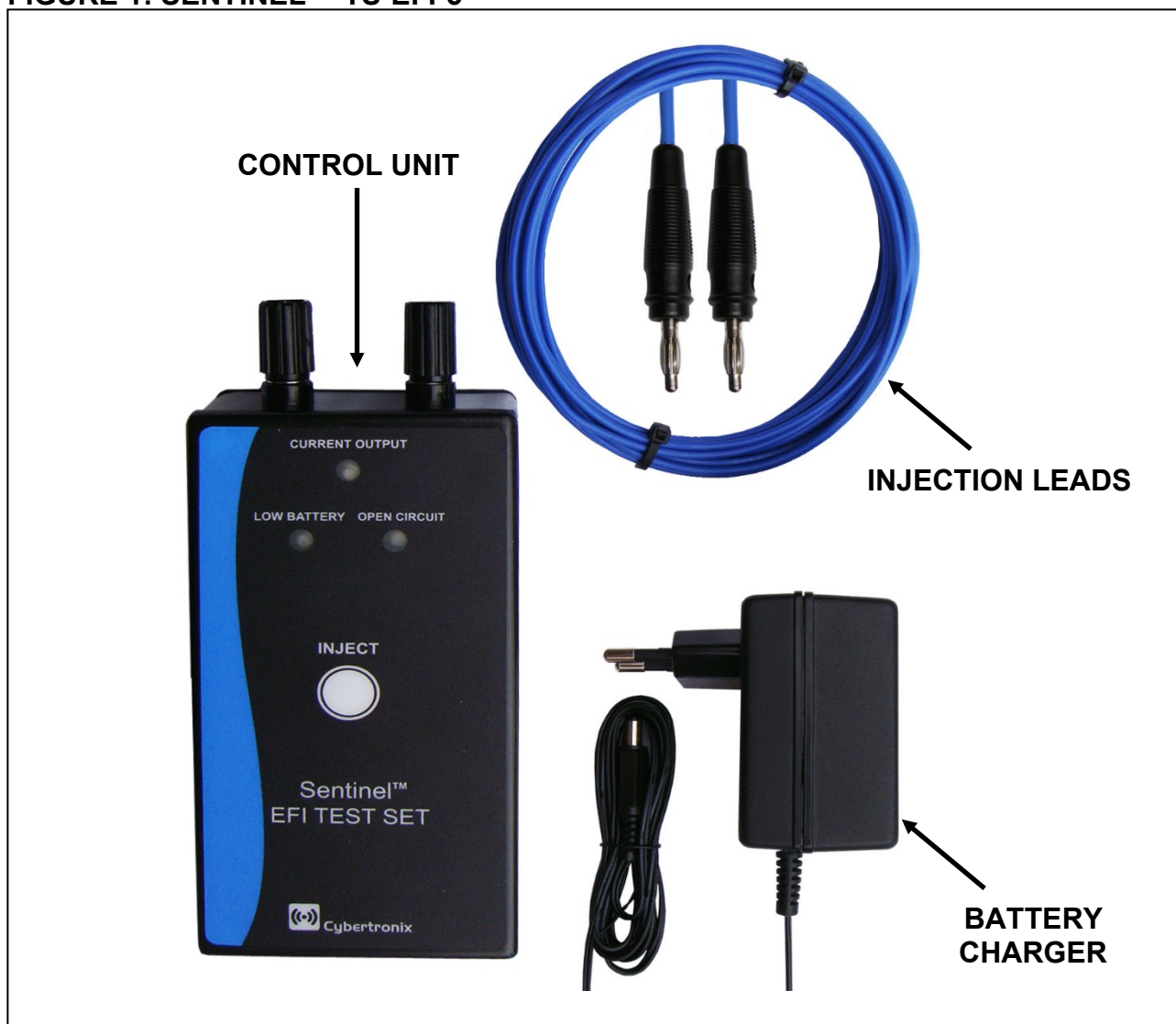
FIGURE 1: SENTINEL™ TS-EFI-5

The Sentinel™ TS-EFI-5 is a battery powered primary injection test set used for testing the trip function of earth fault indicators. It is extremely light-weight, self-contained and portable. The device is contained within a robust black ABS enclosure and ships with test leads and an external battery charger.